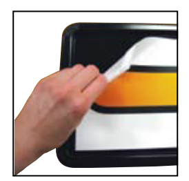
Lay header (B) flat on table. Place header graphic (C) hook side down, on header's loop surface.